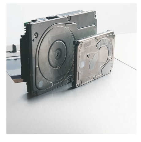
SUITABLE FOR 3.5" AND 2.5" HARD DRIVES The hard drive punch IDEAL 0101 HDP is designed for the two most common hard drive sizes.