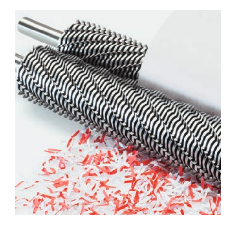
SOLID STEEL CUTTING SHAFTS

Robust and durable: high-quality paper clip proof cutting shafts with lifetime guarantee under conditions of fair wear and tear (except fine cut model SMC).