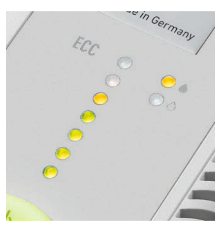
ECC – ELECTRONIC CAPACITY CONTROL This electronic feature indicates the used sheet capacity during shredding process to avoid paper jams.

Ease of operation: intelligent multifunction switch element with integrated optical signals indicating the operational status. Additional "emergency switch" function.